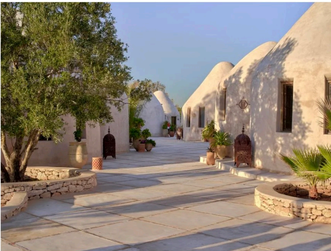
Les Jardins de Villa Maroc

So much for relaxation, one could say. Or one could say, "Let's go to the countryside," because now there's a lovely new place to do so. The owners of Essaouira's stylish Villa Maroc hotel have maintained a private three-bedroom villa about six miles from the city center for a number of years now. In late 2019, they added 11 striking new accommodation structures for couples or solo travelers and turned their Les Jardins de Villa Maroc into a full-fledged hotel.